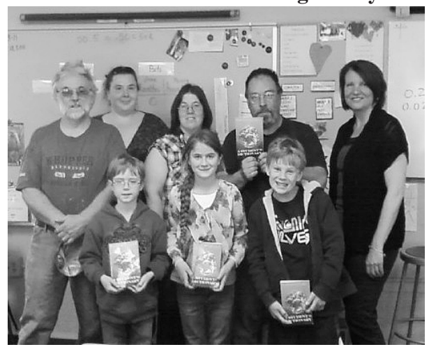
Dictionary Presentation by Croyden Grange in May, 2011

RESOLVED, that the NH State Grange By-Laws Article XII, Section 1, have a new Division created that states: "The NH State Grange Secretary will provide one printed copy of the Journal of Proceedings to each Subordinate and Pomona Grange each year."