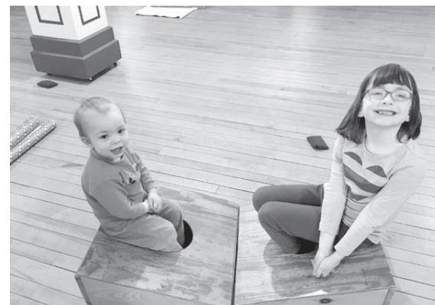
The only picture taken at Game Night.