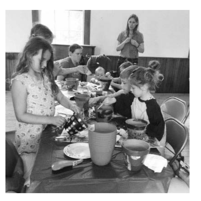
Working on planter crafts at Junior Fun Day.

Then it was time to clean up the Grange Hall before the final event of the day, a trip to Chuckster's for Mini-Golf. The group gradually dispersed from Chuckster's, after completing as much of the course as the children of various ages could handle.