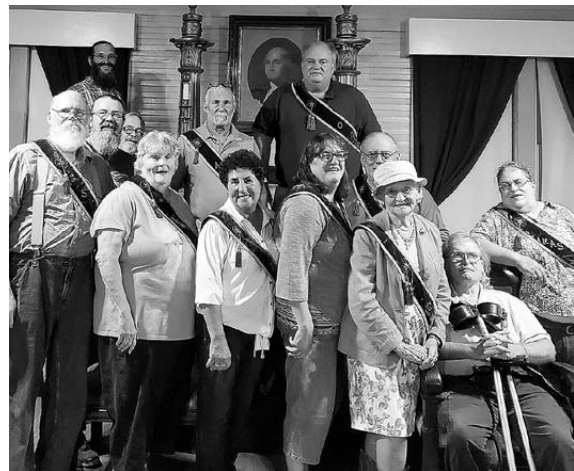
Cocheco Grange wishes our fellow Grangers a Merry Christmas and a Happy New Year.

In closing, I want to wish all of you 25th in 2021. The event will be held at el to be with family, let us share all the Days End Campground. There are a few good things that we have accomplished national attractions near Sturgis that you this past year. Let us tell our family and Devil's tower and Deadwood. There was Hugs are amazing things and serve many Grange Revival. Please note that Golden Grange year and I am sure that we will New Hampshire!